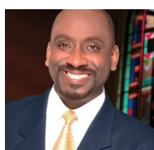
Welcome New Interim