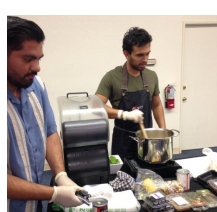
Cooking Class Delights!