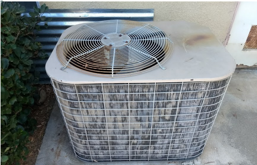
Our A/C Units are Tired, Old, and Sick—but not for long!

Thanks and Hallelujahs to all who sold items, scrimped, and saved to help us reach our