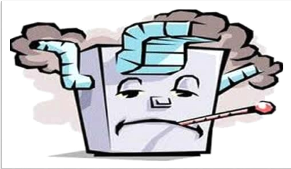
Our A/C Units are Tired, Old, and Sick!

We need to replace our heating and cooling units. The 11-year-old unit is leaking so badly it is not functioning and not repairable. The 19-year-old unit is limping along, but will soon be kaput as well!